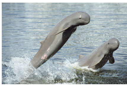
Above: Indus river dolphin Rescue operation, Left: Irrawaddy dolphins